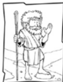
JOHN THE BAPTIST